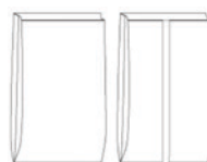
Side Gusset Bag